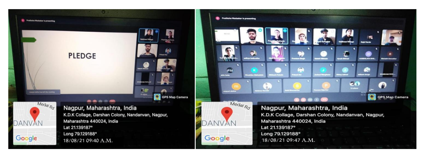
Personal Hygiene Day