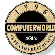
Oracle Developer/2000 Best Service/Support