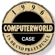
Oracle Designer/2000 Best Service/Support