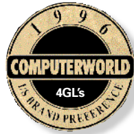
Oracle Developer/2000 Best Technology