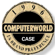
Oracle Designer/2000 Best Price/Performance