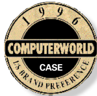
Oracle Designer/2000 Prefer to do business with