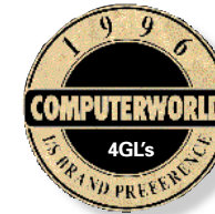
Oracle Developer/2000 Best Documentation