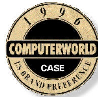
Oracle Designer/2000 Installed in Company