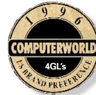
Oracle Developer/2000 Prefer to do business with