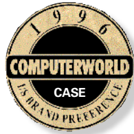
Oracle Designer/2000 Best Technology