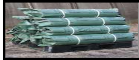
Fig. Contents of Concrete Cloth

CC bulk rolls are individually wrapped and palletized. All CC rolls are provided with a basic hydration guide placed within the packaging. CC batched rolls are individually wrapped in airtight packaging and palletized. 10 batched rolls fit on a standard 4'x 4' pallet. CC13 is not supplied in a standard batch roll size.