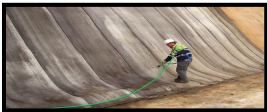
Fig. Hydration